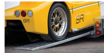
2.4m loading ramps as standard.