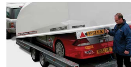
Locking stainless steel door lock, gas spring assisted opening.