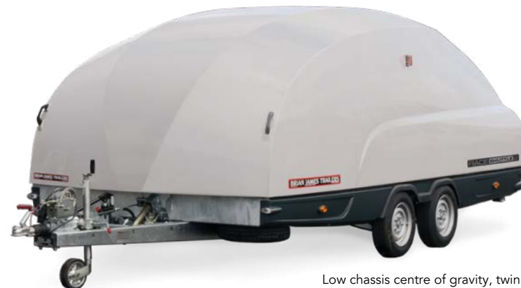
Low chassis centre of gravity, twin axle and excellent aerodynamics ensures safe, stable, towing stability.