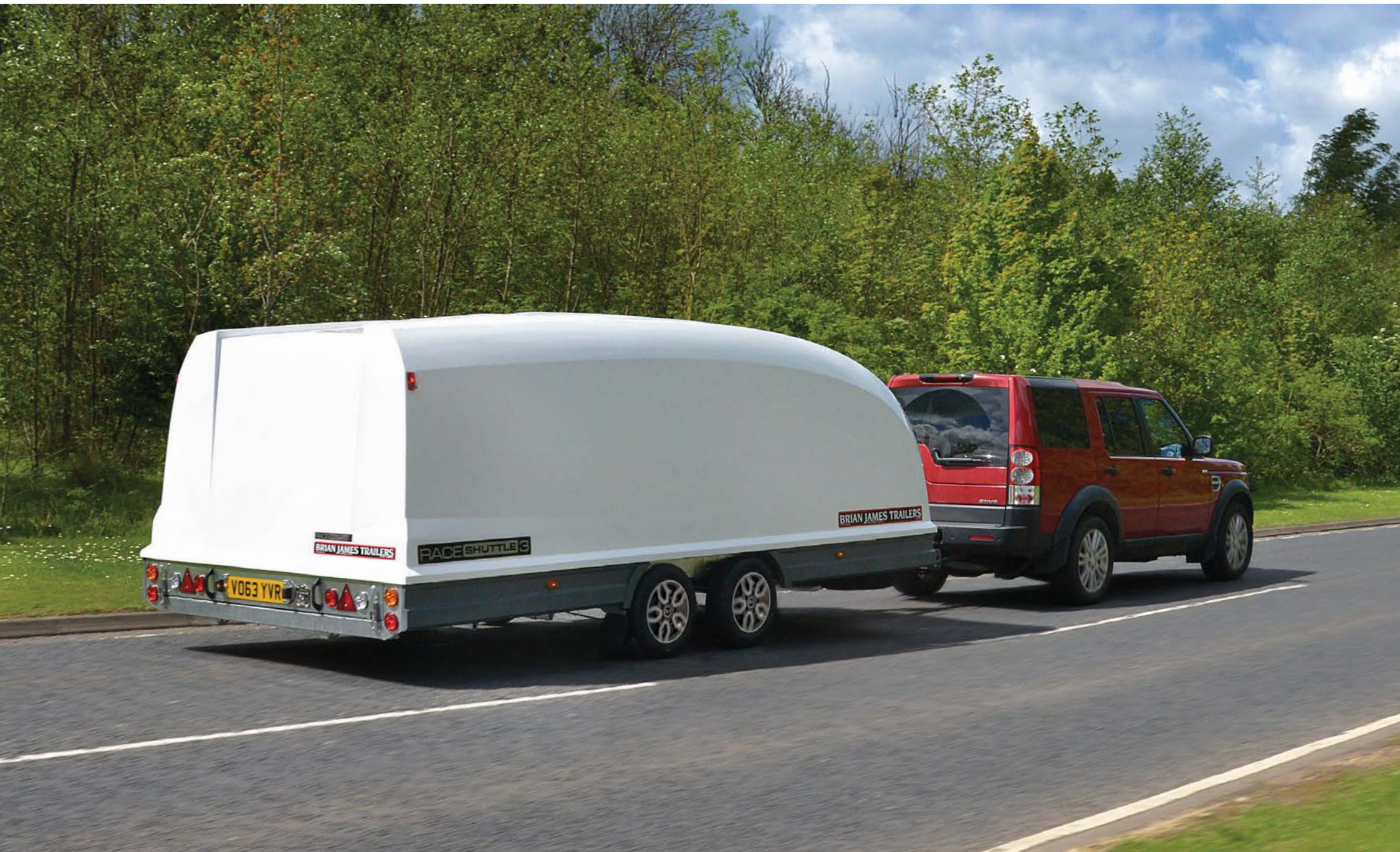
RACE SHUTTLE 3