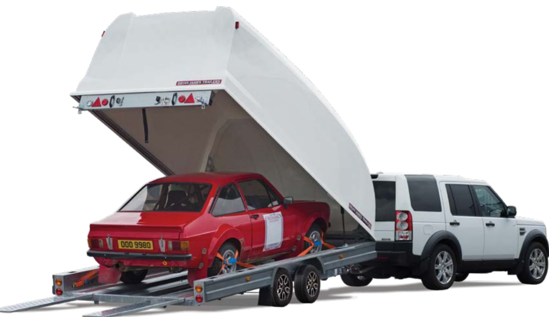
Race Shuttle 3 with optional alloy wheels. Available in either standard Silver or diamond cut Anthracite finish.

The range of applications in which the Race Shuttle 3 has proven to be extremely capable extends from the world of rallying, club racing, right through to formula series racing.