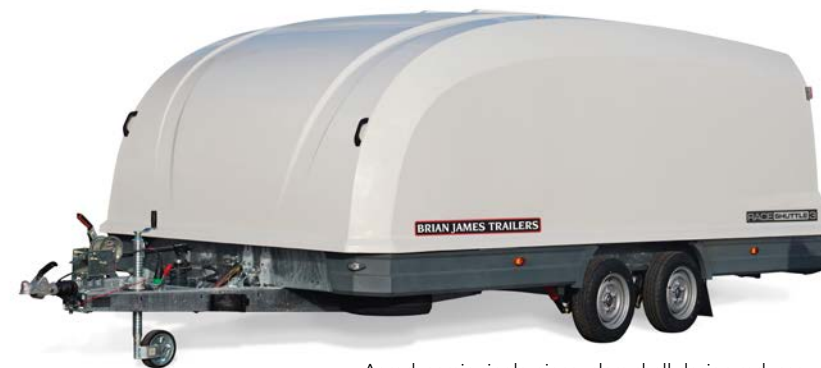
Aerodynamic single piece, clam shell design reduces wind drag and improves towing fuel consumption.