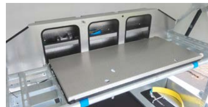
Tyre rack + fuel storage + work bench. (option). *check suitability of race or saloon car.